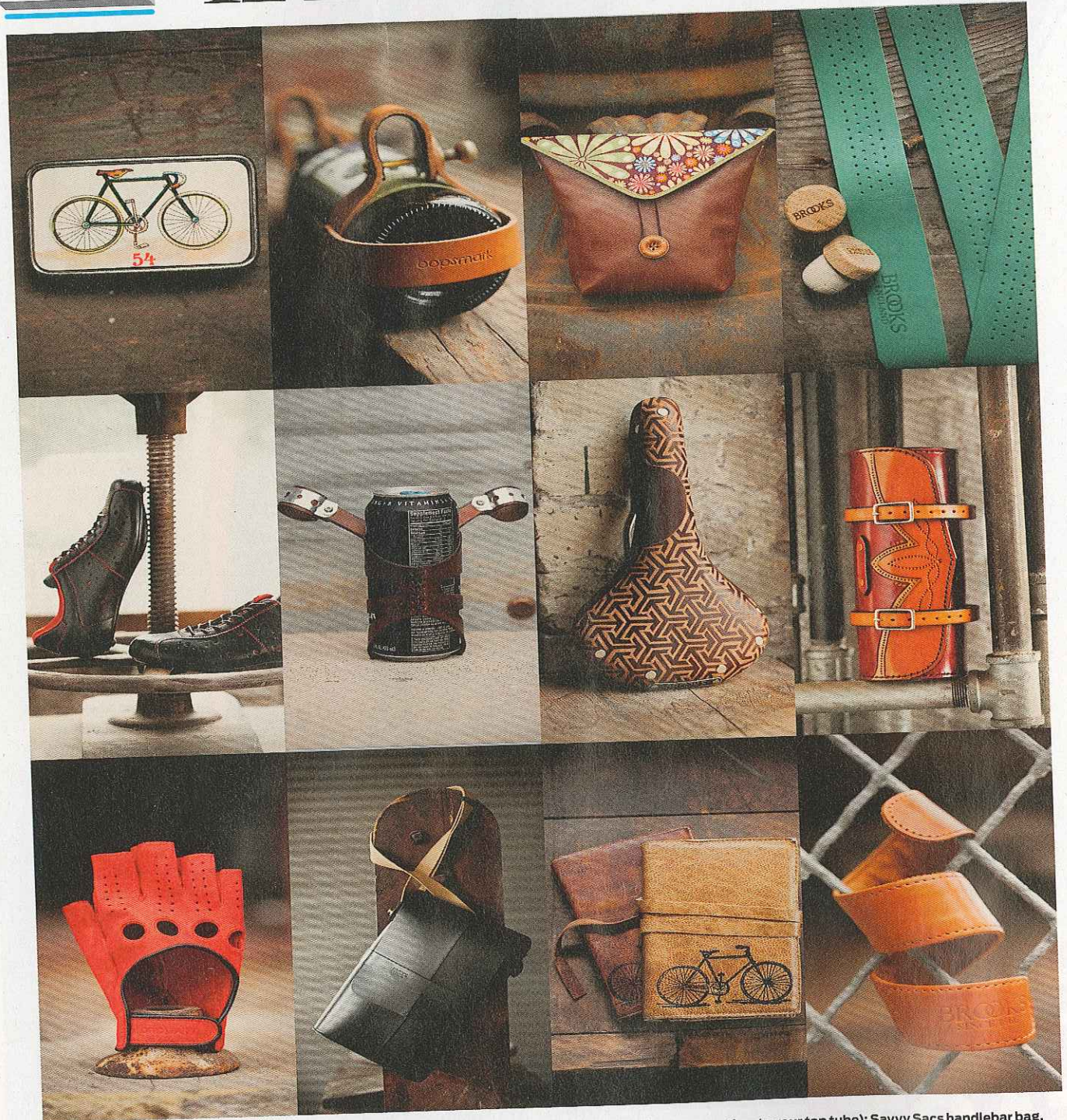
Left to right, from top row: Bmused vintage bicycle belt buckle, $20; Oopsmark bicycle wine rack, $30 (attaches to your top tube); Savvy Sacs handlebar bag, $30; Brooks bar tape, $70 (available in nine additional colors); Dromarti Race Black shoes, $209; Walnut Studiolo Bicycle Can Cage, $45 (clamps to the bar and stem); Kara Ginther carved Brooks saddle in geometric pattern, $375 (custom orders available); Choirbox handlebar/saddlebag, $180; Dromarti Gara Rosso mitts, $130; Brooks SOHO shoulder bag, $370; Inblue journal, $25 (record your ride memories); Brooks trouser strap, $30 (an urban cyclist's pant saver)

1845: A British patent is issued to Robert W. Thomson for the first leather-covered pneumatic tires that were either laced or held together by rivets.